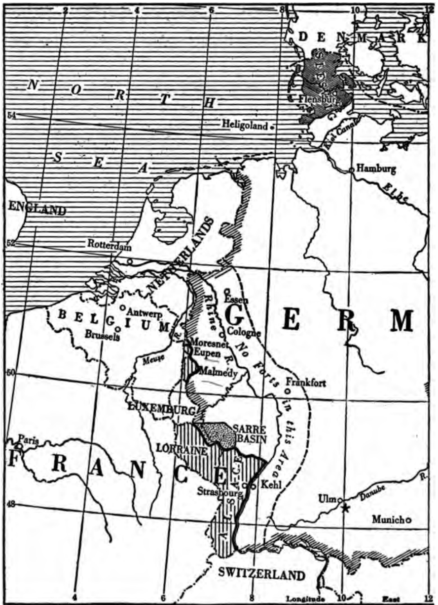
GERMANY—SHOWING THE NEW BOUNDARIES AND THE DISPOSITIONS